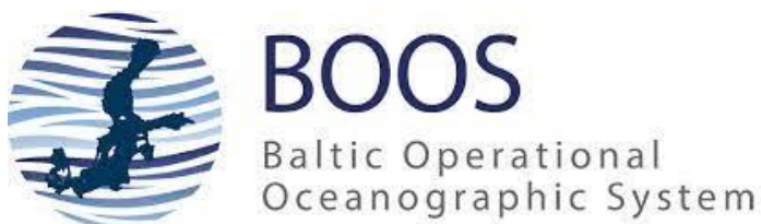
Figure 2. Current BOOS logo

Current BOOS logo is shown in Fig. 2. BOOS STG received the request from EuroGOOS Office and suggested this vote to the BOOS General Assembly.