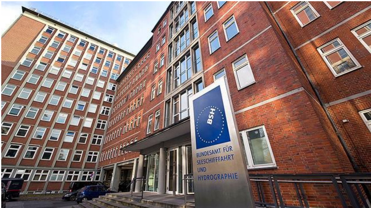
Entrance of the German Hydrographic Office (BSH)

Bundesamt für Seeschifffahrt und Hydrographie (BSH) Bernhard-Nocht-Straße 78 20359 Hamburg